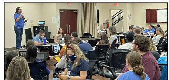
NEW EMPLOYEE ORIENTATION