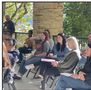
LITIGATION PERSUASION INSTITUTE