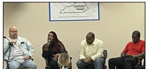
KENTUCKY INNOCENCE PROJECT EVENT HONORING EXONEREES

173 New Kentucky Innocence Project Cases